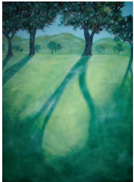
"Tree Shadows" oil 24" x 30", 2004