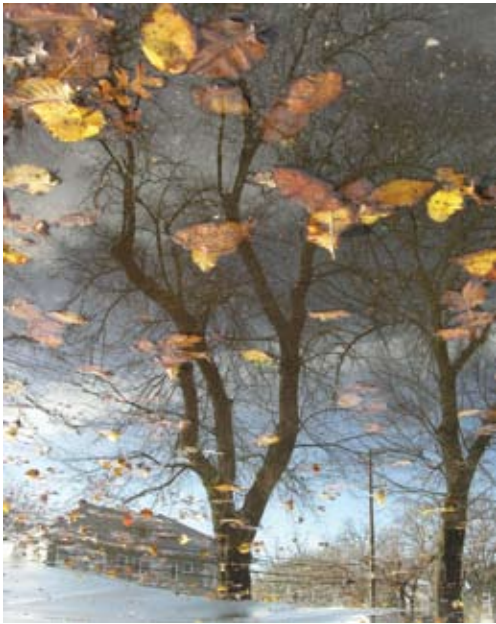
Digital Photo: Tree Reflection in Parking Lot with Colorful Leaves